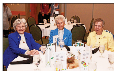
Volunteers enjoy lunch at the Volunteer Appreciation Luncheon in 2023.

“We’re so grateful for all of our amazing volunteers who dedicate their time and talents to making