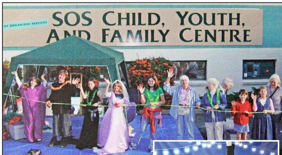
Top photo, the SOS Child, Youth & Family Centre Grand Opening, Sept. 2004. Bottom photo, SOS GradWear program models, 2024.

“My two sons benefited from being cuddled and cared for each Wednesday morning for two hours. They also benefited from having a relaxed and refreshed mother to come home with,” she said. “I met other mothers who had similar concerns to mine, and I formed some lifelong friendships. The program helped all of us deal with the demands of motherhood and both the moms and children